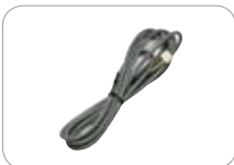
Cable-2.5M Hotron 2.5M Cable