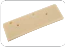
1200R Spacer for installation on a round door