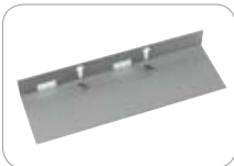
UTB-HR100 Ceiling attached bracket