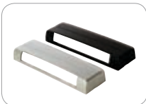
HR94D-COV/BL Black sensor cover HR94D-COV/S Silver sensor cover