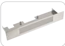
ITB-HR100 Ceiling recessed bracket