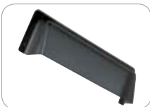
WC/BL Black weather cover